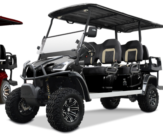
SIRIUS 4+2 LIFTED

Specifications are subject to change without notification