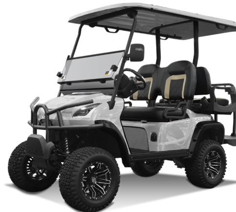
SIRIUS 2+2 LIFTED