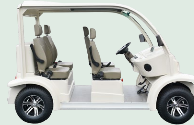
Open seating area with adjustable arm rests and seat backs (AP48-04 shown)