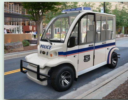
Security vehicle option (AP48-04-D-Police shown)