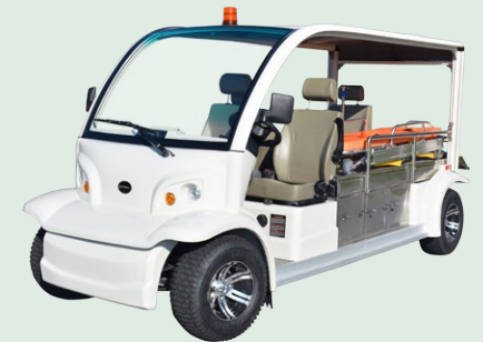
Ambulance vehicle option (AP48-04-Ambulance shown)