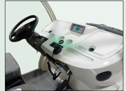
Front dashboard with detailed analog display